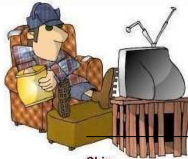
Chip Munchies for the TV

toolbars whether the toolbars are locked or unlocked. But if you want to move or size the toolbars, you need to unlock them first.