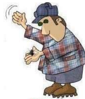
Byte Whut dem dang flys do